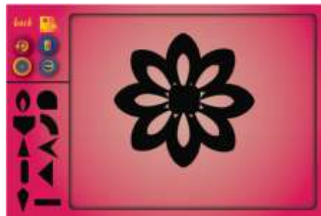
Figure 11. The artistic skills practice pretest of respondent #3

The artistic skills results of the control group are showing a slight difference from the experimental group as the students were using limited shapes to create the artwork. The artwork does not utilize most of the provided shape and thus the artwork produced is showing monotonous composition that leads to static and flat results. This is due to the limitation of knowledge and the style of work from the control group. The students only focus on the rhythm principle and the repetition of shapes is done to produce the artwork as shown in Figure 11.