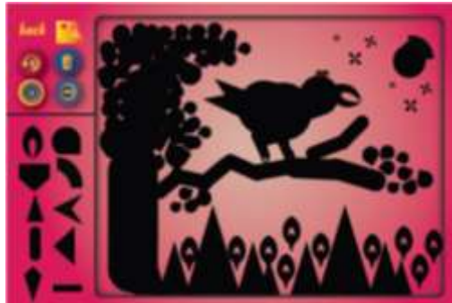
Figure 10. The posttest of artistic skills practice respondent #2

The shapes are repeated to create movement so the visual effect emerges are more free and spontaneous to avoid dull and boring artwork. Apart from balance, the ADE students from the experimental group also emphasized the principle of rhythm and movement using curved and small shapes. The movement in the merging lines illustrates the feelings and actions in the artwork. The artwork also refers to the emphasis principle to make the objects appear larger to create a focal point.