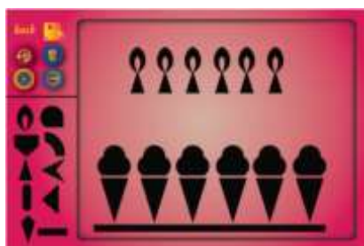
Figure 14. The artistic skills practice pretest of respondent #4

Another example of the pretest results of the control group is shown in Figure 13 and the posttest result is in Figure 14. The artistic skills results of the control group are showing significant differences from the experimental group. Therefore, the knowledge of artistic skills is vital to create interesting artwork to prepare students for their future career in teaching the Visual Art Education subject.