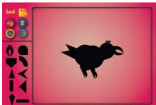
Figure 9. The pretest of artistic skills practice respondent #2

Figure 9 is the initial ideas of the students during the pretest process and Figure 10 is the results of the posttest of the same student after the treatment.