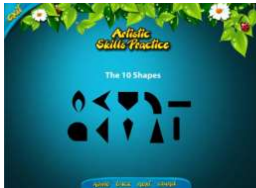
Figure 4. The interface design of the artistic skills practice

The courseware has been fully utilized and controlled by the ADE students which enables them to learn by themselves. It is provided with animation for navigation and developed according to the capabilities of the users. Major ranges of possible learning outcomes have been suggested for the identification of the content areas and further assisting the ADE students to understand and combine the easily accessible activities, according to their preferences and learning needs. The courseware has been used as a medium of instructional technology and has been utilized in this study as a function that can be highlighted for identifying the TPSACK of the ADE students.