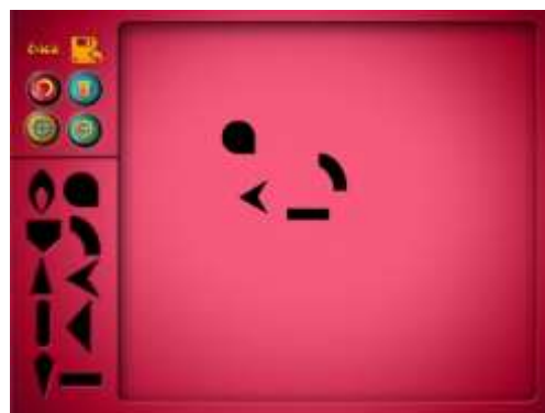
Figure 5. The interface design of the artistic skills practice

Figure 4 is showing the main shapes provided in the artistic skills practice when the ADE students construct their ideas to create an artwork. The research goal is to demonstrate the value of creative limitations and it allows the ADE students to demonstrate their ability in creating a stunning piece with limited means. This artistic skills practice is the core of the TPSACK courseware that has been developed. It gives priority to the 10 limited shapes so that the ADE students can use them during the process of producing the artwork. With these shapes, the ADE students are challenged to create their unique artwork, within the limitations provided in the exercise. Therefore, they are challenged to create a single piece within a strict set of guidelines, and through this practice, it comes down to pure skills and imagination. Furthermore, color is not provided and the exercise uses only black color to encourage students to produce work in a negative and positive way as the aim of this exercise is to see how the ADE student will perform within limited context.