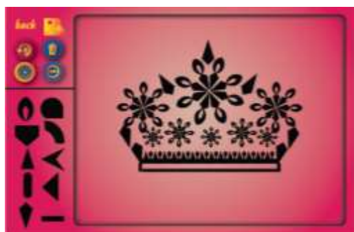
Figure 8. The artistic skills practice pretest of respondent #1

The black shapes are placed on a contrasting red background to create lights (see Figure 7). The artwork also shows the elements of space to give imagination of distance and the size of the shapes can be adjusted to create a high and low appearance (see Figure 8). In terms of form, the student's artwork can be described as using various forms to portray visual aesthetics.