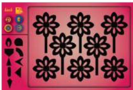
Figure 12. The artistic skills practice pretest of respondent #3

However, some of the students managed to utilize more shapes and produce an interesting composition as shown in Figure 11. Even though the artwork in Figure 12 are showing less usage of shape yet the composition of a larger and smaller object has successfully shown perspective and therefore the artwork is interesting to perceive. With the use of smaller objects on top and larger objects at the bottom, the artwork managed to spark aesthetic value through the illusion of perspective created.