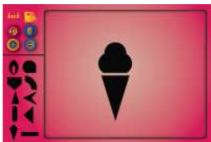
Figure 13. The artistic skills practice pretest of respondent #4

However, some of the students managed to utilize more shapes and produce an interesting composition as shown in Figure 11. Even though the artwork in Figure 12 are showing less usage of shape yet the composition of a larger and smaller object has successfully shown perspective and therefore the artwork is interesting to perceive. With the use of smaller objects on top and larger objects at the bottom, the artwork managed to spark aesthetic value through the illusion of perspective created.