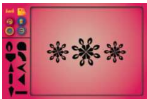
Figure 7. The artistic skills practice pretest of student #1

The black shapes are placed on a contrasting red background to create lights (see Figure 7). The artwork also shows the elements of space to give imagination of distance and the size of the shapes can be adjusted to create a high and low appearance (see Figure 8). In terms of form, the student's artwork can be described as using various forms to portray visual aesthetics.