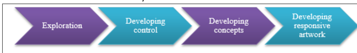
Figure 1. The Artistic Skills Foundation

The artistic skills knowledge requires the knowledge of foundation which has been underlined in understanding the techniques and unique concepts as shown in Figure 1. The requirements for the development of artistic skills and knowledge are important for ADE students to completely understand the concept. The requirement is based on the four steps of instructions to meet the needs of every individual.