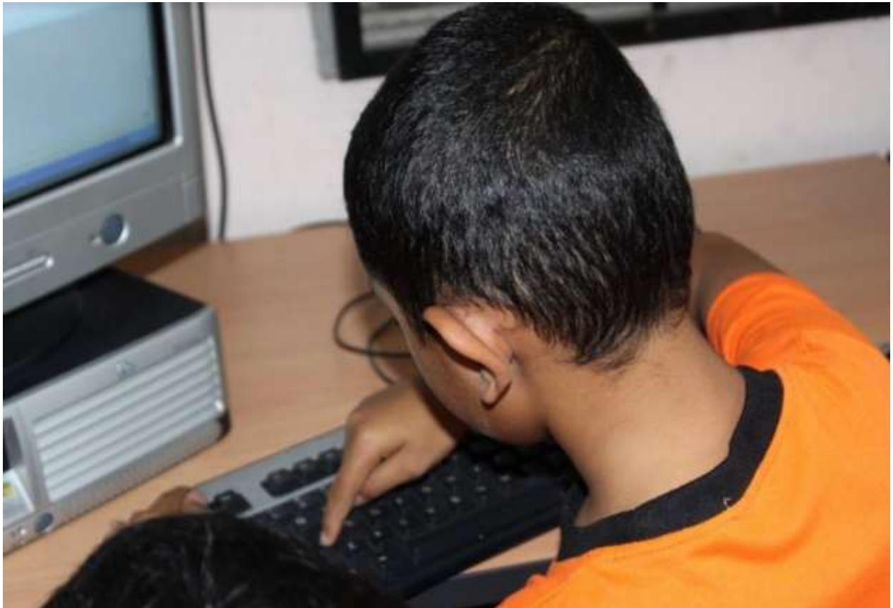
Fig. 3. Respondent able to use computer keyboard