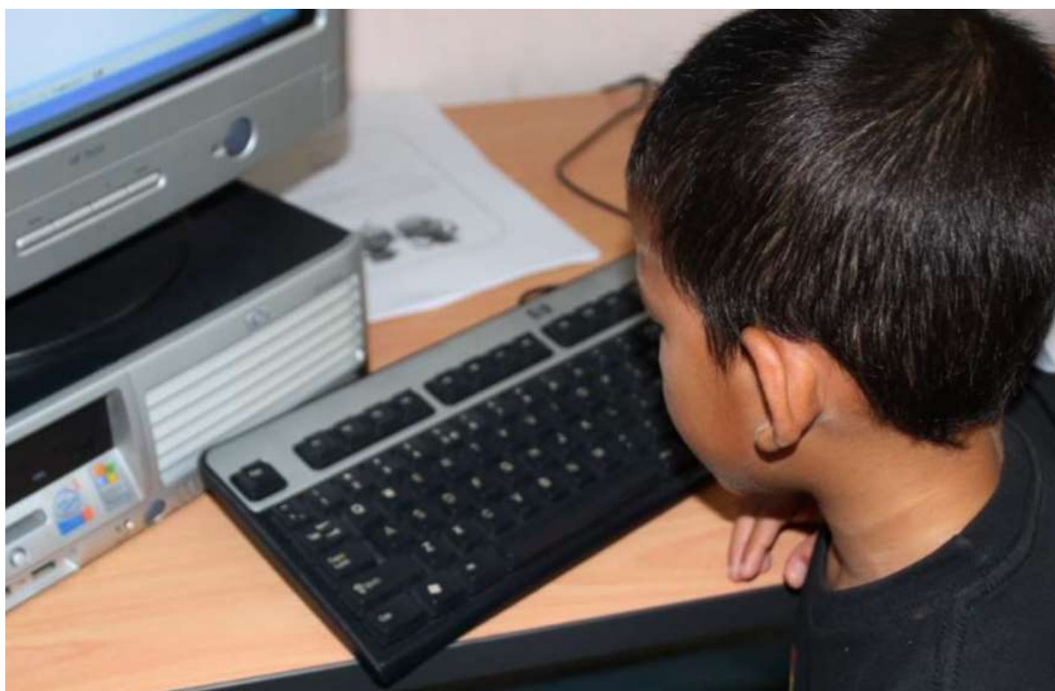
Fig. 1. Students just look at the computer keyboard

Accordingly, the researcher will repeat this process until finds the participants have acquired the skills to use the mouse correctly. Repeating the use of the mouse continuously has been able to improve the skills among the participants in using the mouse (PM1:3; PM1:4; PM2:5). Based on data obtained from triangulation within different Orang Asli Student's observation feedback, it's represented majority Indigenous students involved has lower basic ICT skills which focuses on the skills of turning on the computer, the skills of using the keyboard, and the skills of using the mouse among the indigenous students still low. Fig. 1 shows students only look at the computer keyboard without doing any of the task Research findings show that basic ICT skills which focuses on the skills of turning on the computer, the skills of using the keyboard, and the skills of using the mouse among the indigenous students still low provided by the facilitator. This due to the students that has no experience on how to utilise computer keyboard. Based on this limitation, students unable to perform well during class session.