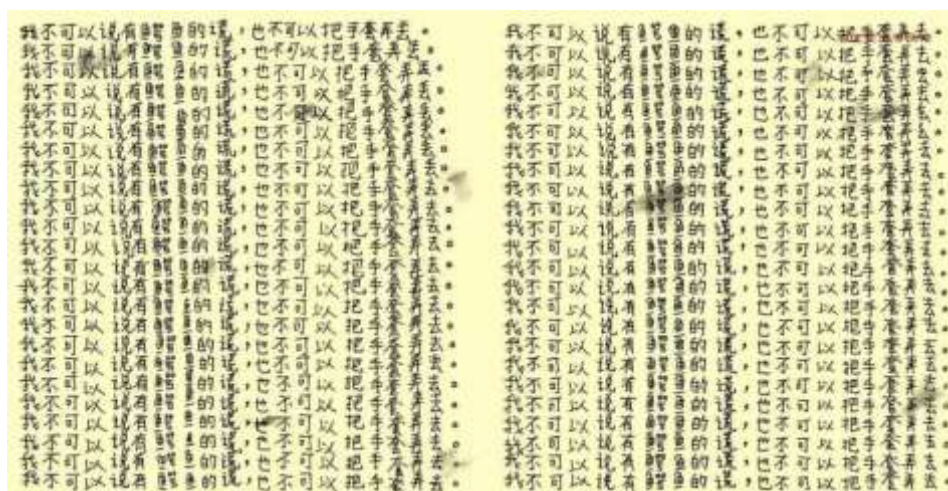
Figure3. Full of pages of self-criticism in Chi Dao Da Wang front-page

what the child said is true from the child's point of view, but only denies these incredible things from the adult's point of view and puts pressure on the boy as a teacher. However, the little boy has to be punished again and again because of the authority of the teacher. By the fourth time, the author broke this cycle. This time, nothing happened to the boy on his way to school, and he arrived at school safely. However, unexpectedly, this time, the teacher met with a situation, and like the boy, an incredible strange thing happened. And the reaction the boy gave seemed reasonable when the teacher asked the boy for help: "John Patrick Norman McHennessy! I've been caught by a furry gorilla on the roof, you have to find a way to get me down!" The boy no longer believes what the teacher says, telling him, "Teacher, there's no such thing as a furry gorilla around here!" This ending echoes everything that happened earlier.