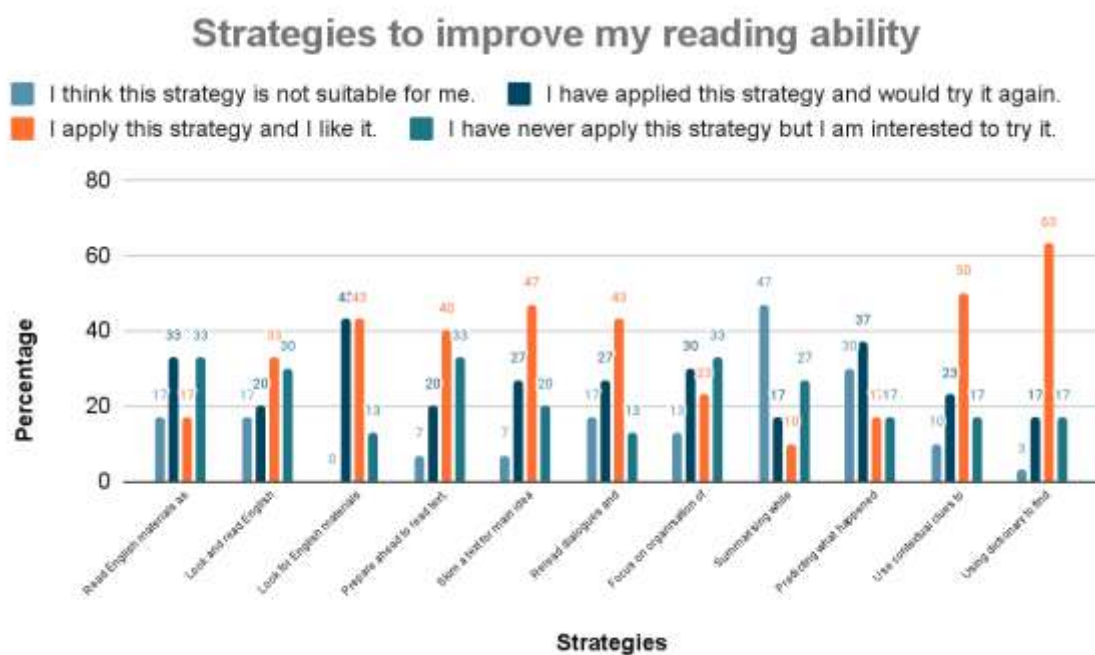
Figure 2. Strategies to improve reading

(40%) followed by "look for English materials to read for enjoyment" strategy at 33% which is equivalent to 10 respondents. This is aligned with the claim that the pre-reading stage might be difficult for low-proficient readers compared to high-proficient readers who can understand pictures or illustrations (Ozek & Civelek, 2006, as cited in Par, 2020). Students thought the sole purpose of reading was to add new knowledge, but it also works to ease the mind if you enjoy reading. For some students, reading is boring, and thus, they become too lazy to read books (Mujahidah & Ramli, 2019). The strategies with less than 10 respondents chose the strategies: 7 respondents chose the "focus on how the text is organised, specifically the headings and subheadings" strategy (23%) and interestingly, two strategies shared the same percentage, which "read as much English materials" and predict what is going to happen next" strategy with only 5 respondents (17%). The least utilised strategy goes to "I continue to summarise as I read" with only 3 respondents (10%), and surprisingly, it is also the highest-rated strategy, with 14 respondents (47%) agreeing the strategy does not suit them. This is supported by research done by Behtash et al (2019) that summarising was one of the least frequently used strategies for reading. This finding corroborated previous research by Wahyudin and Rido (2020), which mentioned that students employ distinct methods and strategies according to their needs.