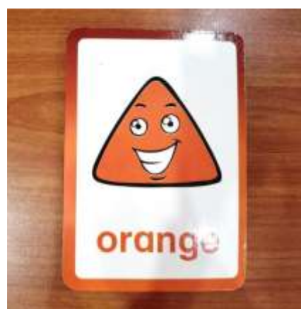
Figure 3 Flashcards used by TEACHER