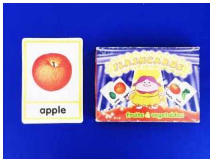
Figure 2 Flashcards used by CIKGU

"... Here is the size of the flashcards that this preschool used, some of them are in A6, some bigger than that..."