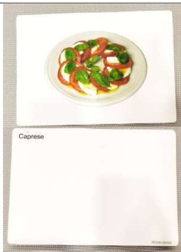
Figure 5 Front (card at the top) and back (card at the bottom) of SENSEI's flashcards