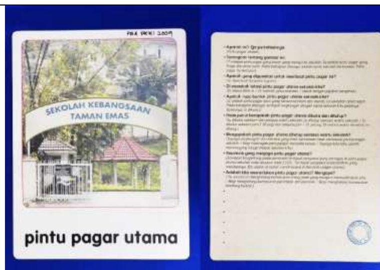
Figure 5 Front (card on the left) and back (card on the right) of CIKGU's flashcards

"... Then, the front and the back are different. There are two sides. Behind, it is the writing, while the front has the images. Or there may also have writing only... "