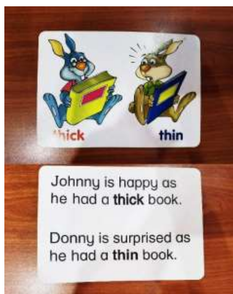
Figure 6 Front (card at the top) and back (card at the bottom) of TEACHER's flashcards