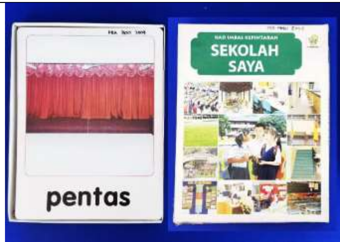
Figure 1 Flashcards provided by MOE to CIKGU