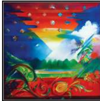
Figure 2: 'Sireh Pinang' by Syed Ahmad Jamal

Figure 2 shows the work by Syed Ahmad Jamal that was produced in 1982. The formalistic aspect that we can see in this artwork is the use of geometric patterns that are projected in abstract form. The use of floral motifs which represent an "awan larat" at the bottom of the painting and the palm tree at the right corner of the painting reflects the beauty of the Malay world. Syed Ahmad Jamal's works are determined as a very symbolic type of artwork. The use of triangle shapes is again represented as an "archetypal" motif. The motifs of awan larat underneath the painting symbolize the element of Malay cultural identity.