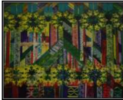
Figure 4: 'Gunungan' by Fatimah Chik

Figure 4 shows the work by Fatimah Chik entitled "Gunungan" which was painted in 1987. She used batik and acrylic to emphasize more on the motif of floral as well as the triangle shapes that were inspired by the concept of the mountain. The motif of nature and floral that are being applied in this artwork are composed well balanced. Besides that, the triangular shapes become the main form of this artwork which pointed to the upright position. Looking at the style of the mountains that usually being projected in Fatimah's masterpiece, she generates the artwork that brings the elements of Malay traditional art. This meant that the existence of the Malay cultural traditions can be detected in her work thus the work can be seen as a cultural style (Basaree, 2003).