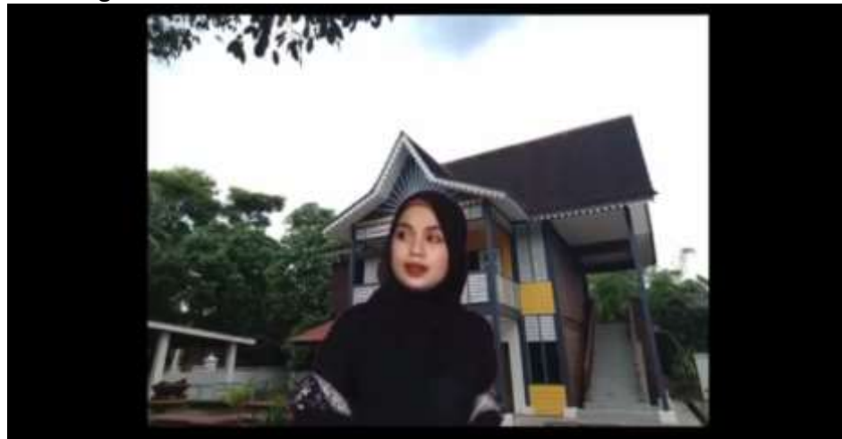
Figure 2: A student acting out a scene from the story of The Curse of Mahsuri.

and information, but the presentation of ideas and information evokes a sense of emotion, in addition to stimulating the mind and intellect of the reader.