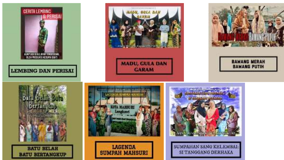
Figure 3: Posters of adaptations of the folklore and fables showcased.

'Adaptation of traditional screen art' imposes to bring an impact to the society with the understanding of concepts as well as the value of the myriad traditional folk literature within the country. By showcasing this online theatre, fresh new ideas are bursting and bubbling in the minds of these students as initiatives in ensuring the interests and assets of the Malay literature in Malaysia is up for further developments by upcoming generations. Example: