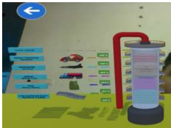
Fig. 2. Example of AR 3D objects

development of an augmented reality environment. After the first stage is completed, the development of the courseware then will continue using Unity3D software. This software is chosen for this courseware because the software has an ability to create and develop an augmented reality content and transform from 2D image to 3D objects. Figure 2 shows examples of the augmented 3D objects used in this study.