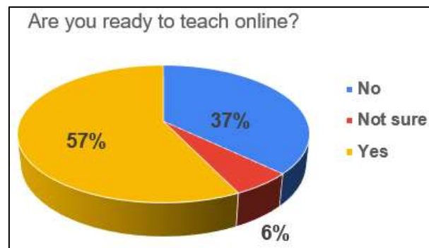
Figure 3. Teachers' Readiness to Teach Online

Table 7 shows the percentage of respondents according to gender and age regarding their readiness to teach online. From the result, it shows that similar trend for both gender where about half of female respondents (59%) and also half of male (50%) respondents gave positive response that they are ready to teach online.