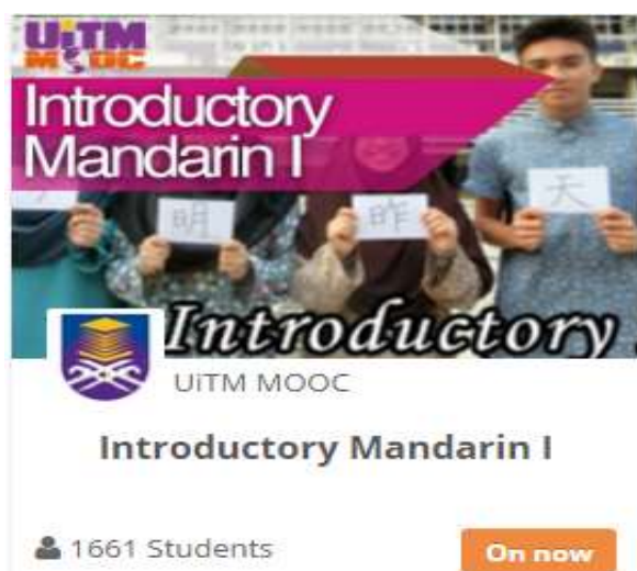
Introductory Mandarin 1 cover page

viii) Internet link : Links to Internet resources relevant to each theme are included in each topic for students to enhance their vocabulary through the extra information related to the themes being learned.