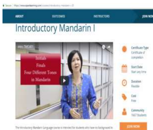
Introductory Mandarin 1 registration page