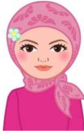
Figure 3: Kawaii-style pedagogical agent

final iteration for the present designs where changes were made based on the feedbacks from experts as shown below (Figure 3). Now, the developed animated pedagogical agent is ready to be embedded implement in the VLE.