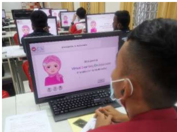
Figure 5: Usability testing with polytechnic students

The PSSUQ questionnaire was completed by 39 respondents who are polytechnic students. At first, the students have been given a general explanation about the VLE and instructions on answering the PSSUQ questionnaire. Thereafter, students went through the VLE for around 20 minutes. The PSSUQ questionnaire sets were distributed as soon as students completed using the VLE. Respondents took ten to fifteen minutes to answer all the items in the PSSUQ questionnaire.