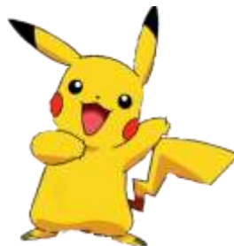
Figure 1: Pikachu (Pokémon GO, 2018)

Among the characteristics that facilitate the identification and fondness for a pedagogical agent comes from the attractiveness of pedagogical agent that is formed from its' physical resemblance including gender, age, and race. Hence, a female, young, attractive, and cool design of pedagogical agent is appropriate solution to develop an appealing agent for education purpose (Van der Meij et al. 2015). Such a design may benefit both male and female students equally (Plant et al., 2009). From the point of view of kawaii, it is often associated with girls and women (Macpherson and Jane, 2018; Nittono, 2016). This is in accordance with the cuteness appearance that appeals more to female than male in connection with the identification of feminine natural characteristics such as small, beautiful, and desirable (Granot et al., 2014). In other words, female character can provide higher ratings of cuteness than male (Nittono et al., 2012). Conversely, students are more influenced by pedagogical agents that are like themselves (Baylor, 2011). On the other hand, learning companion can be portrayed through the image of a youth in her 20s (Tien and Kamisah, 2010). Young Pedagogical agents uphold better outcomes (Johnson, Didonato and Reisslein, 2013). This is