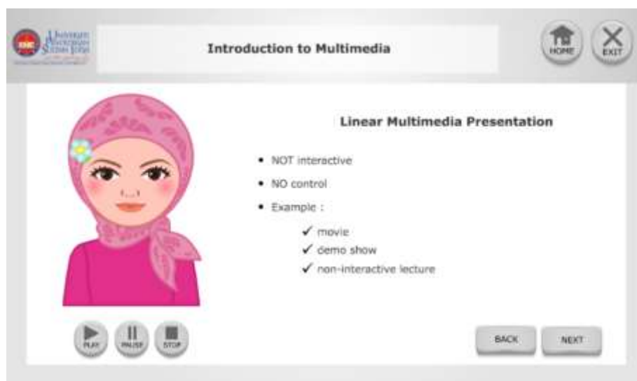
Figure 4: Learning content screen of kawaii-style pedagogical agent

Basically, interfaces of screen designs can be used as part of human-machine interaction. There are multiple interfaces of screen designs with the composition of the various elements and contents that are developed for the Virtual Learning Environment (VLE) as sketched in the design phase. These are inclusive of home screen, learning outcomes screen, learning content screen, interval support screen, quiz screen, question screen, feedback screen, reward screen and review screen. After the development of the interfaces of screen designs using authorizing software, the screens were arranged logically and linked to each other. Each of the screen was embedded with the designed kawaii-style pedagogical agent. The final products of the VLE were sent to expert for validation before they were used for research purpose. Consequently, The VLE was accepted by the experts. Thus, the following iteration was not carried out for the development of interfaces of screen designs of the VLE.