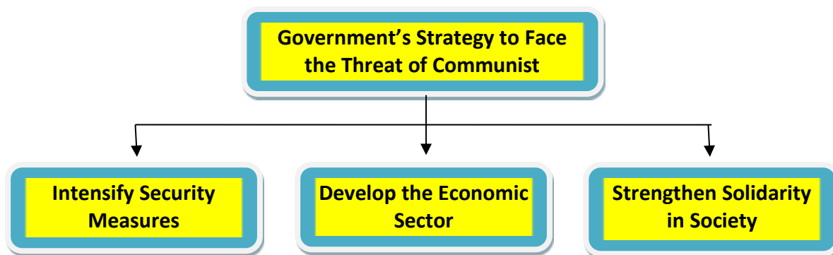
Figure 2 Government's Strategy to Face the threat of Communist in the Country

Source: Adapted from the Government White Paper: Communist threat to the Federation of Malaya. Volume 1. No. 23. Kuala Lumpur: Government Restructuring Office. 1959.