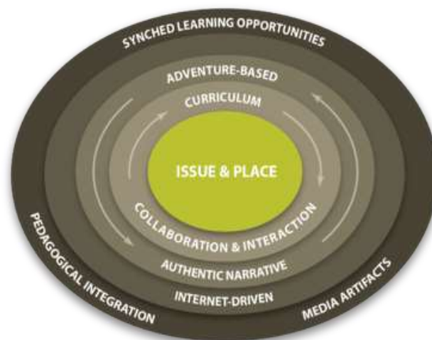
Figure 1: Adventure- Based Learning Model (Doering, 2006)

The implementation of ABL should take into account all of the above principles. The research and inquiry-based curriculum is the first principle of ABL. This principle requires us to highlight problem-solving learning concepts involving active student engagement. The second principle is the opportunity for collaboration between students, lecturers and experts. This principle means that during the learning process using the ABL method, interaction between students, lecturers and scholars is required. The third and fourth principle is that the use of the internet as a medium of learning and media and text can be delivered in a timely manner. This principle emphasizes the concept of information sharing through mediums such as smartphones or laptops. Thus, the use of the internet is crucial as a medium of media and text sharing. The next principle is that consistency in educational