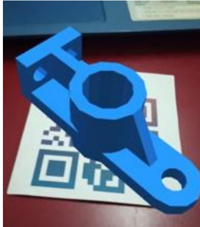
Fig. 2 Augmented 3D objects

This tool is used under the philosophy of Constructivist Learning, in which students are actively involved in the learning process and lecture roles as facilitators (Kudryashova et al., 2015). The result is a learner-centered environment in which students can pace their learning. The teaching and learning tools were designed using the ADDIE Model. Examples of the augmented 3D objects used in this study are shown in Figure 2.