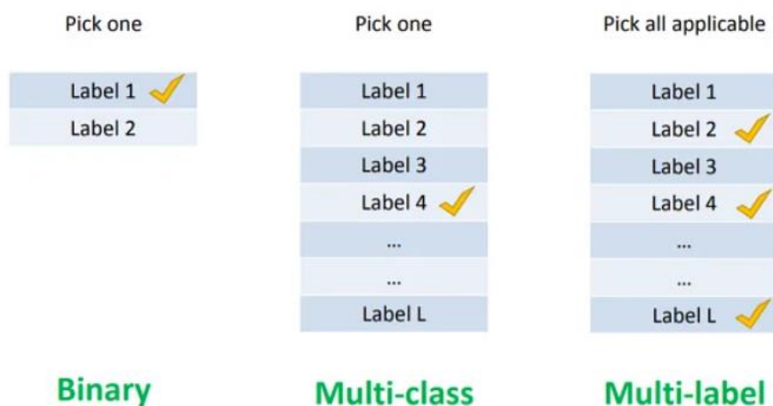
Figure 1. Infographics for 3 concepts of classes in data mining (Projectpro, 2023).

Acquiring accurate predictions can be a complex endeavour, despite the effective application of data mining in educational contexts. However, the dependability of these methods is still in its infancy, and the extraction of novel and valuable knowledge remains imperfect. The aforementioned research demonstrates positive outcomes when the analysis includes one or two types of data, typically pertaining to demographics and academic performance. However, the multiclass scenario presents additional complexities as the classifier is required to differentiate among a large number of classes in order to generate accurate predictions. The term "multi-class" pertains to situations when predictions involve more than two classes. Typically, predictions involve a positive class (labelled as 1) and a complementary class (labelled as 0). Yet in multi-class scenarios, there are two or more classes, and each occurrence is associated with only one class. When occurrences are associated with more than one class, the dataset is referred to as having multi-label classes (Agrawal & Sah, 2022). Figure 1 depicts an infographic that serves to distinguish between the three concepts of classes in the target attribute for prediction.