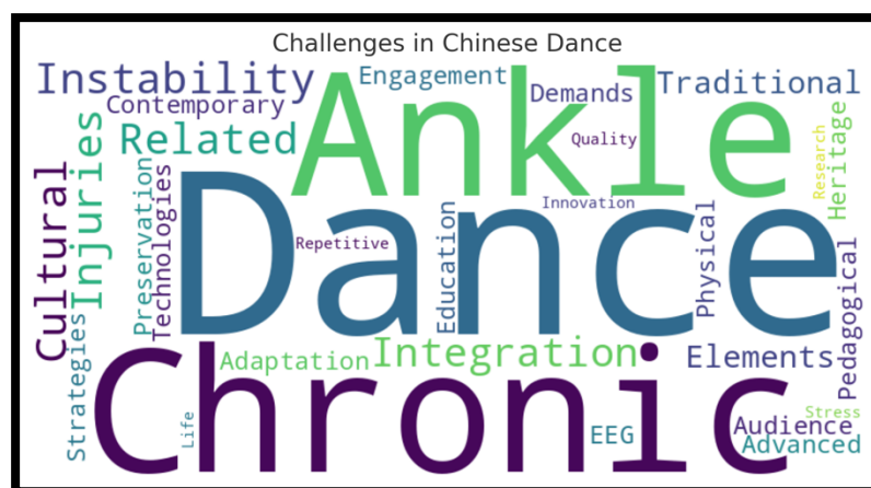
Figure 2. Wordcloud of Challenges Identified