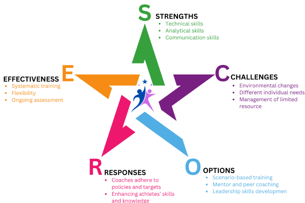
Figure 2: Framework of the SCORE Model on Agile Coaching

Communication and motivational skills should not be underestimated. Coaches need to deliver instructions clearly and provide constructive feedback to motivate athletes. A good relationship between coach and athlete can enhance the athlete's enthusiasm and overall performance. Continuous evaluation is key to success in agile coaching. Coaches need to collect and analyze performance data regularly, obtain feedback from athletes, and make necessary adjustments in the training approach. This process ensures that the coaching strategy is constantly updated and improved according to the needs. By considering all these factors, coaches can ensure that their approach is effective in helping athletes reach their maximum potential.