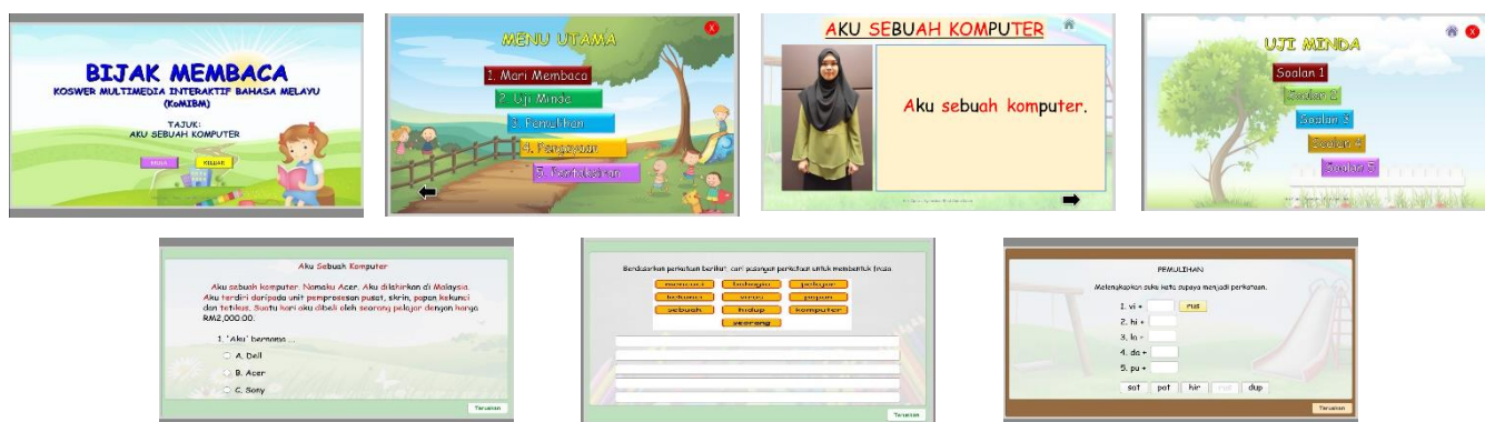
Figure 2. Final courseware

The evaluation by content experts and multimedia experts were done to propose suggestions for the prototype. The content experts were selected among teacher who teach in deaf classes for more than 10 years of experience. In this study, three teachers were selected. The content experts propose suggestions in four categories: (1) instructional design, (2) contents, (3) user control and (4) technical. The multimedia experts were two lecturers which propose suggestions in multimedia design and interactive design. The final courseware is shown in Figure 2 below.