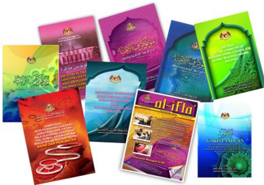
Figure 4: Example of Fatwa Publication

The publication of fatwas is one of the fatwa institution initiatives to facilitate the delivery of information as there are a handful of people who have no access to the relevant websites. With fatwa publications, it is easier for the public to understand the law of resolving issues without relying solely on the role of the media. Indirectly, it can increase the level of readability and knowledge of the society more widely and in detail.