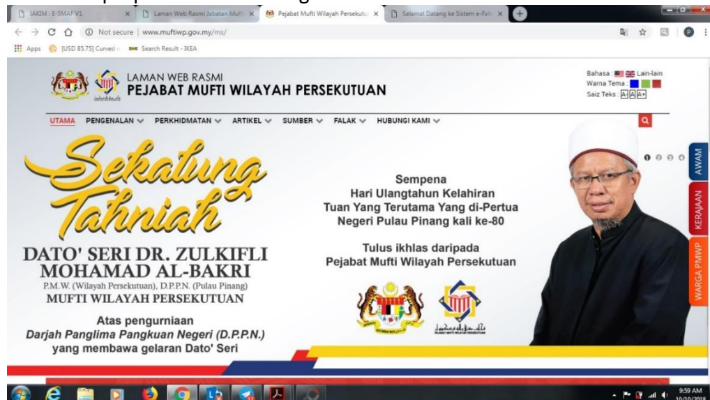
Figure 3: Mufti of Federal Territory Mufti Official Website

In addition, the Mufti Department in Malaysia also uses social media approaches in delivering or providing fatwa information to the public as it can provide space for the community to directly interact with the mufti department in asking the questions regarding the fatwa issued. This medium is a clear sign of the importance of social media as a medium of rapid information dissemination (Zain et.al, 2018). The diagram below is an example of the use of media used for the purpose of distributing fatwa.