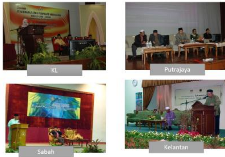
Figure 5: Fatwa Education Seminar/Discourse