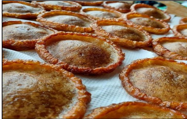
Figure 3: Penan Penyarem

process. Having periods for women is considered being in a non-hygienic condition and it is believed that women in the said condition will not be able to produce or prepare Penyarem that is considered to be in good condition as well. As a result, it is also not acceptable for the Baleik power.