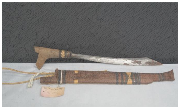
Figure 5: Ilang

Ilang is known as machetes made of iron. During the Pakan ceremony, Ilang is a symbol of the spirit of its community. It is used to perform traditional dance such as Ngajat . According to the Penan tradition, Ilang must be used during Pakan . This is because it is able to strengthen individuals or one's spirit, and the religious leader will hold it behind the person who attended the Pinum ceremony. Ilang is made of iron and only those with experience are the ones who are able to create it. Iron symbolises violence, whereby the spirit of the people must be as strong as iron in order to overcome the problems that surround them for days to come.