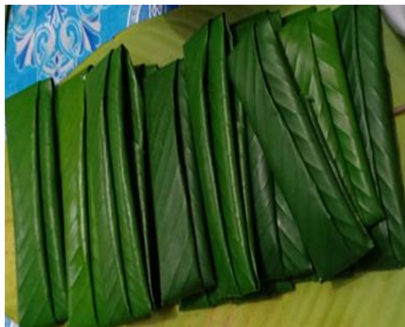
Figure 2: Penan Lupeh

When making Lupeh , there are a few precautions or restrictions to be obeyed. Cooking utensils for cooking Lupeh must be clean because cleanliness is a priority. Lupeh is usually prepared by women and not men. For the Penan community, their women are given priority in preparing meals at the kitchen, while their men are devoted to doing heavy work. For example, Lupeh served for the Baleik power and supernatural power should be cooked in a container that has never been used for cooking pork. If it happens, then the presentation is not acceptable. Lupeh will be placed on a bronze pedestal, symbolizing the prestige or splendor of the family. Ordinary people without extraordinary powers will not eat the Lupeh served to the Baleik . Only those with Baleik power are allowed to eat the Lupeh that has been given to other powers. Lupeh served for guests will be exiled. Lupeh is an identity of the Jelalong Penan community as it shows that Jelalong Penan has a long history of cultivation although not massively. Jelalong Penans need foods like rice, sweet potato and sago as their main food. Due to this, the community will prepare Lupeh , whether traditional Lupeh or the modern Lupeh during the Pakan ceremony and it does not matter how they are prepared as long as it is served.