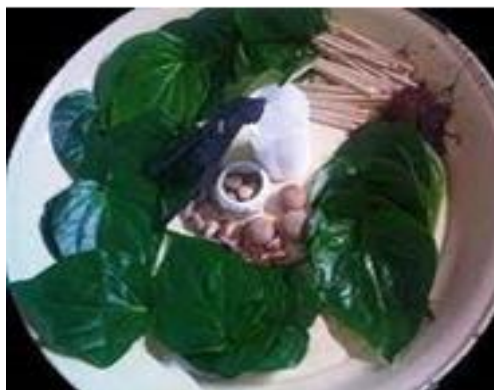
Figure 6: Sipak and Gulung