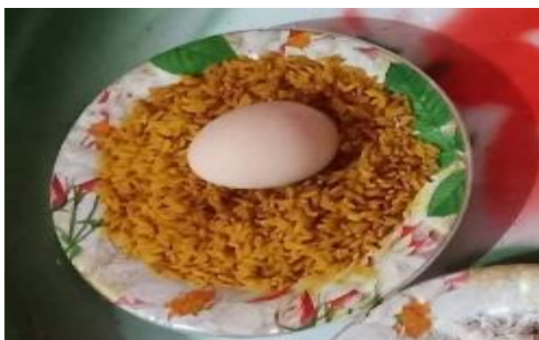
Figure 7: Yellow rice and egg

The yellow rice, also known as Vas Kuneng , is a must have dish during the Pakan ritual. For the Penan people, the ceremony would not be perfect without the yellow rice. Cooked eggs should also be served on top of the yellow rice. While raw eggs will be eaten by the devotees during the Pakan ritual. There is no restriction on the preparation of these two ingredients according to the elderly. The said three ingredients are only necessary in the preparation of the food preparation requested by Baleik . But for the religious feast of the Penan community, they do not provide yellow rice and eggs on the basis of their religious claims. Yellow rice that carries the meaning of peace and unity and blessings so that you can get abundant life from God. While the egg is an meaning of human life because the humans should be at peace with nature and at peace with God because that egg is placed on a yellow rice. The yellow rice was used to summon the spirit of the ruler who was in the forest.