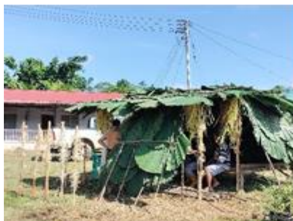
Figure 4: Lopau Tapok Pakan

Tapok is a flower made of timber which is said to be softened to become a flower. The usage of Tapok is vital during the Pakan ceremony. The Tapok flower is made of certain wood and those who are involved in its making process are those who are experienced. Tapok will not happen if the flowers are not softened the correct way. The Tapok timber is a forest product which will be used by the Penans and even at the present time, Tapok is still being used by other races as well during any ceremony or event. During the Pinum ceremony, every Tapok timber symbolises the number of days in which Pinum is performed. For example, the Pakan Tapok symbolises the day in which the Pinum ceremony is conducted. The usual Tapok are normally designed in a shorter height with only as tall as one or two feet tall. Meanwhile, the Pakan Tapok is a much taller one which is as tall as five to six feet tall. Every single Pakan Tapok symbolises either one, two, three or four until seven days in which the Pinum ceremony is conducted. This means that it represents the number of days the rituals are performed.