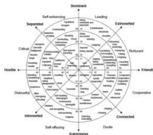
Figure 2. Character diagram