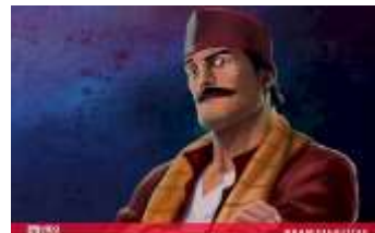
Figure 6. Character 2