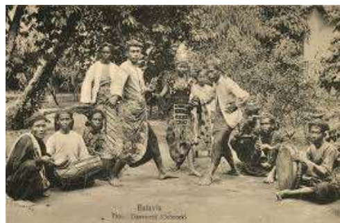
Figure 3. Fashion model

The picture that can be collected during this research is as we can see above, there are some details which are then the result of analytical logic. As an illustration of how a character can be created. Not always the data we get can be directly described directly. There are times when the data is information that is indirect. Some data is required but not explicitly described in the description. An example is how the clothes worn by Si Pitung. Because this is not described directly, we can take the data from the visualization of trends in the period or period of Si Pitung.