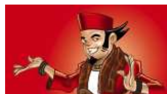
Figure 8. Character 4