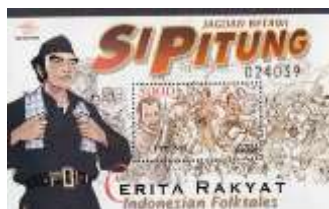
Figure 5. Character 1

Regarding character design, our focus of attention is the design result in comic form. The following examples are a visualization that tries to present Si Pitung in its form as a concrete character.