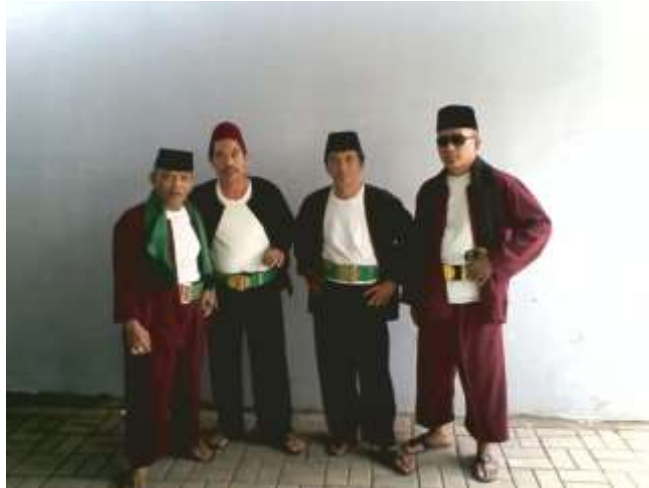
Figure 4. Character shape

The picture above is the clothes commonly worn by the Betawi people in the period 1888-1924, the models used are then visualized differently and are more directed to the Betawi tradition wearing models that look more modern. Basically the shape or model of clothing worn is known as pangsi clothes. This model then shifted to a more modern clothing model by adding belts and caps. This effort is actually a data simplification which in fact will further obscure the actual figure of the character that will be designed and presented visually. It is possible that decisions are made based on logical assumptions, but it is better if the design is carried out by taking data collection as carefully as possible. Some of the things that become arguments are when a character is visually attached to people's minds whether it is the result of designing in the right way.