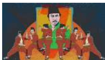
Figure 7. Character 3