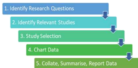
Figure 1. Methodological Framework (Arksey &amp; O'Malley, 2005)

Although outdoor play recently gained focus in the education system, there are still limited literature resources on the impact of outdoor play on children's psychosocial well-being. Therefore, the research question addressed for this review was, 'What is empirically known from the existing literature about outdoor play on children's psychosocial?' This question served as a guide for subsequent research in this study. Table 1 summarises the underlying research questions and research objectives.