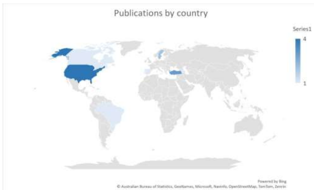
Figure 3: Publications by country